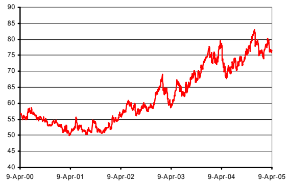
Historical Performance of the S&P Precious Metals Excess Return Index