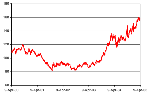
Historical Performance of the S&P Industrial Metals Excess Return Index